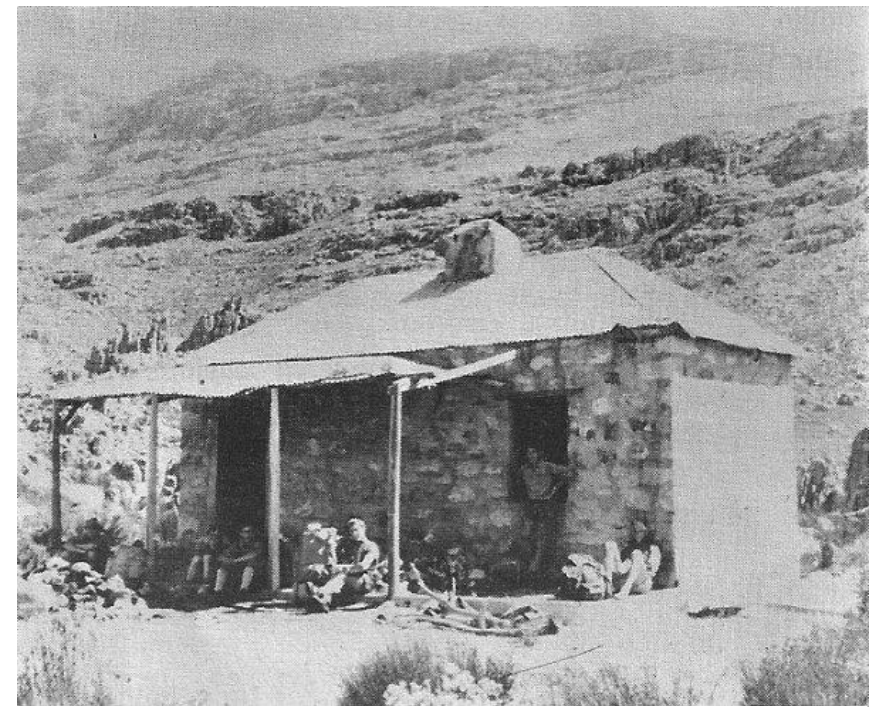
Southern Party at Sneeuberg Hut, where they spent the night. Sneeuberg in background

The Central party set off at the same time as the Southern group and, after leaving their packs at the 4200 ft. level of Welbedacht Cave, sprinted the remaining 2200 ft. up the Tafelberg, roping up the last pitch which is of a "C" standard, and returning to the Cave to sleep. The following morning found them striding Northwards along the Shale Band, around the Langeberg, down Engelsmans Kloof, to Crystal Pool for an afternoon's swimming, where they spent the night. The weather still held out; perfectly clear blue skies, warm and no wind. The final day of their hike, they climbed one of the rock formations known as the Uilsgat Needles, before returning via the Middelberg hut area to the Algeria Station.